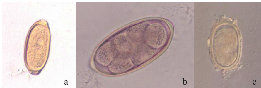
Fig. 1. Endoparasites in pheasant ( Phasianus colchicus ) – flotation method. a) Capillaria spp.; b) Syngamus trachea ; c) Heterakis isolonchae