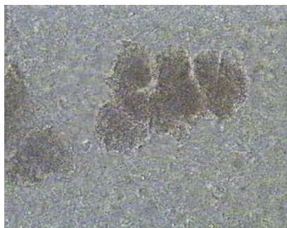
Fig. 2. Microcyst of Sarcocystis spp. – digestive method